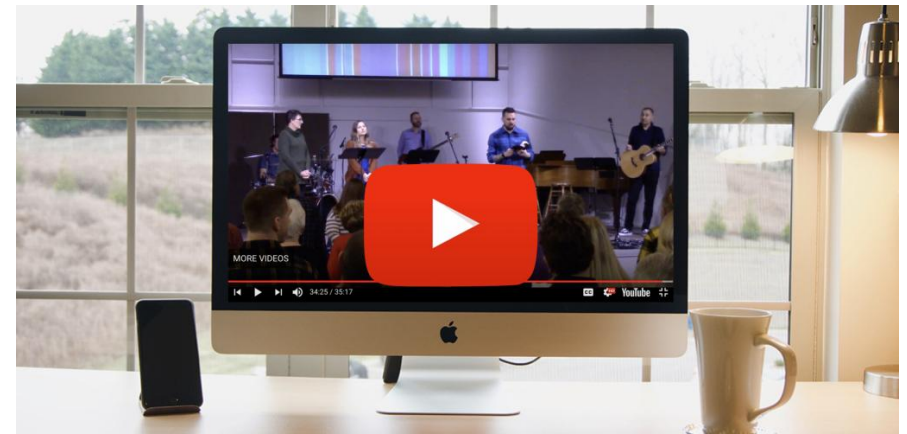
March 22 2020 Online Service